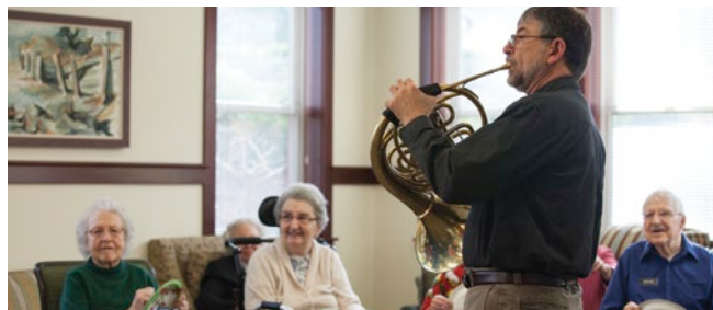
New musicNOW program brought music, memories, and movement to seniors living with dementia.

Fulfilled a community need through the transformative power of music