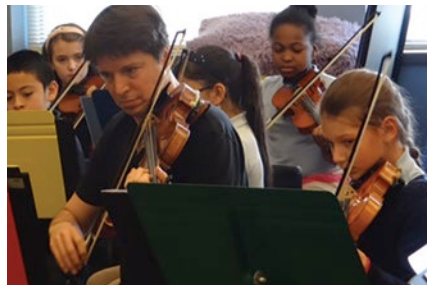
Rosa Parks Bravo Youth Orchestra enjoyed a visit from none other than Joshua Bell.