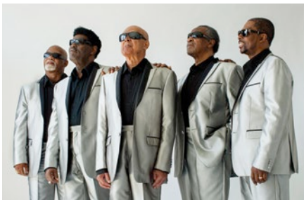
Blind Boys of Alabama

Classical subscription revenue up 5% Classical ticket revenue passes the $3 million mark