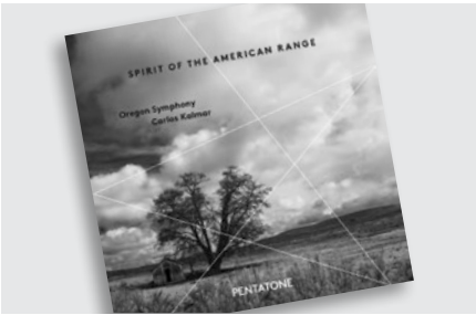
The latest CD – Spirit of the American Range – garnered another Grammy award nomination for Best Orchestral Performance.