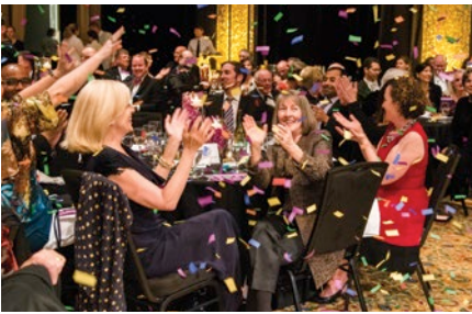
400 attendees at the Annual Gala had a celebratory time and set a new Gala record – $870,000 in contributions.

The total annual budget of $16,665,775 included artistic programming, musician salaries and benefits, community programs, and all administrative costs.