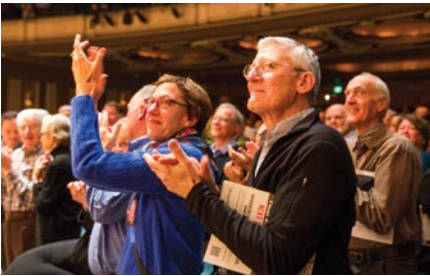
Throughout the season 4,200 donors contributed $7.5 million in generous contributions.