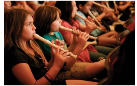
2,700 David Douglas School District students performed with the orchestra at the first-ever Link Up concert.

Over 40,000 people reached beyond the concert hall through our Education and Community Engagement events